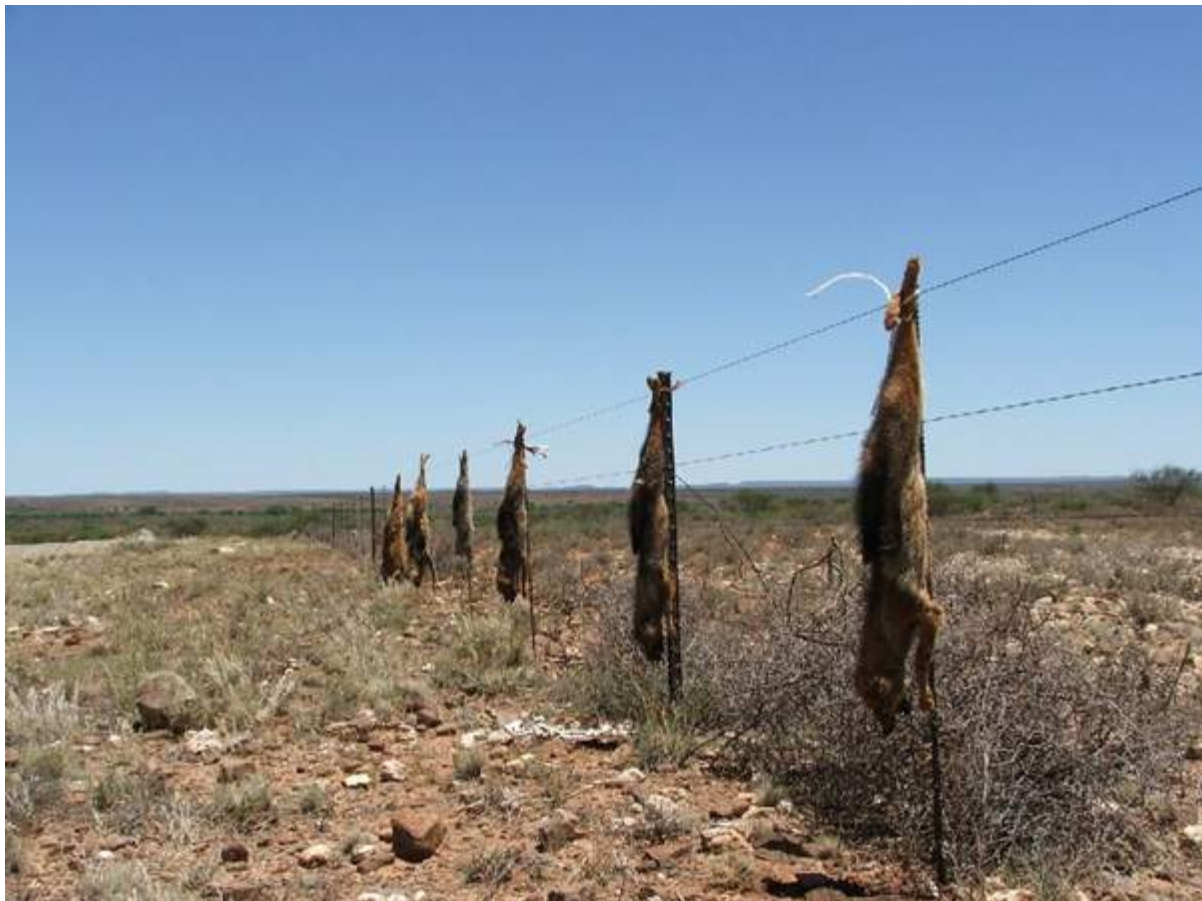
Dead black-backed jackals, Great Karoo. Persecuted????!!