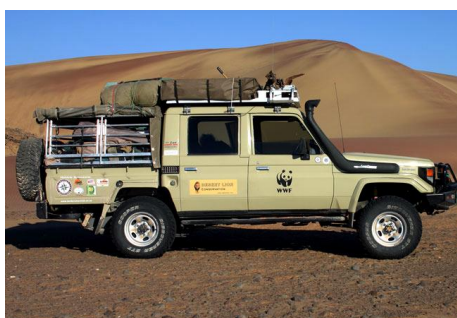
The photograph herewith is of Hagar the Hilux, the now retired field vehicle.